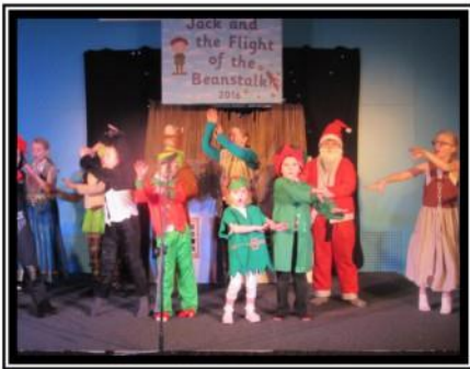
New Staging used for first performance of Jack & the Flight of the Beanstalk

At the close of the year the very first Barrhill Fireworks Display was successfully held in Rinsheen Park and brand new staging was purchased for Barrhill Primary School! The picture shown here is of the very first performance of Jack and the Flight of the Beanstalk using the new staging! If there is any organization or individual who would like to use the staging for any future village event, please get in contact with the BCIC!