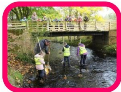
Barrhill Pupils enjoy the river

The first phase of the project focuses on introducing primary school pupils to their local stretch of river and the opportunity to learn about the fish in their river, the invertebrates that the fish feed on and why riparian trees are important for aquatic ecosystem functioning.